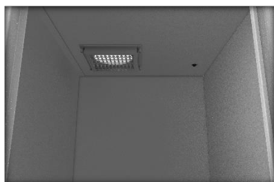
Anemostat with the ability to connect to a ventilation system