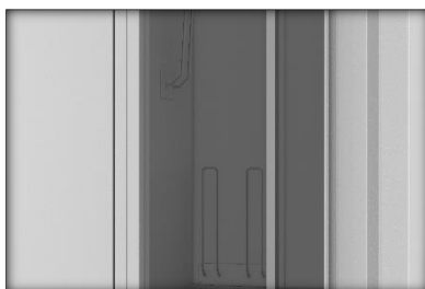
Boot and glove hangers