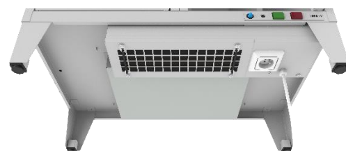
In the variant with a socket, it is located under the bottom plinth